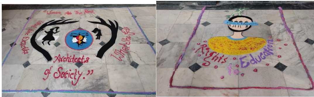
Rangolis Made by NSS Volunteers