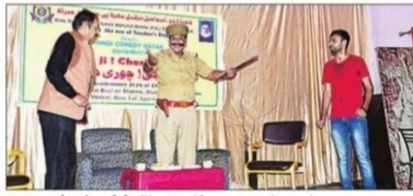
इस्मैल नेशनल महिला पीजी कॉलेज में आयोजित नाटक का मंचन करते कलाकार।