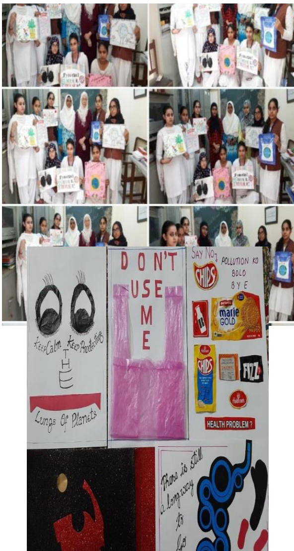
World Water Day: